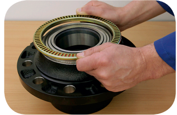
Fig. 4 · Placing toner ring onto wheel hub