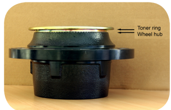
Fig. 7 · Correctly installed toner ring