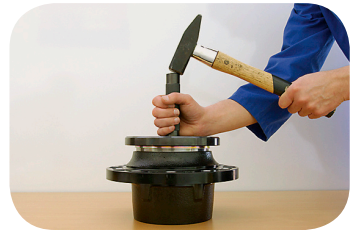
Fig. 6 · Installing toner ring