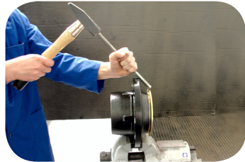
Fig. 3 · Removing the toner ring