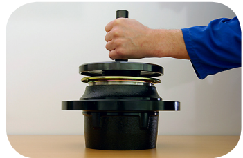
Fig. 5 · Placing installation tool onto hub