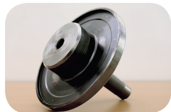
Fig. 2 · Toner ring installation tool

SAF toner ring installation tool (Fig. 2)