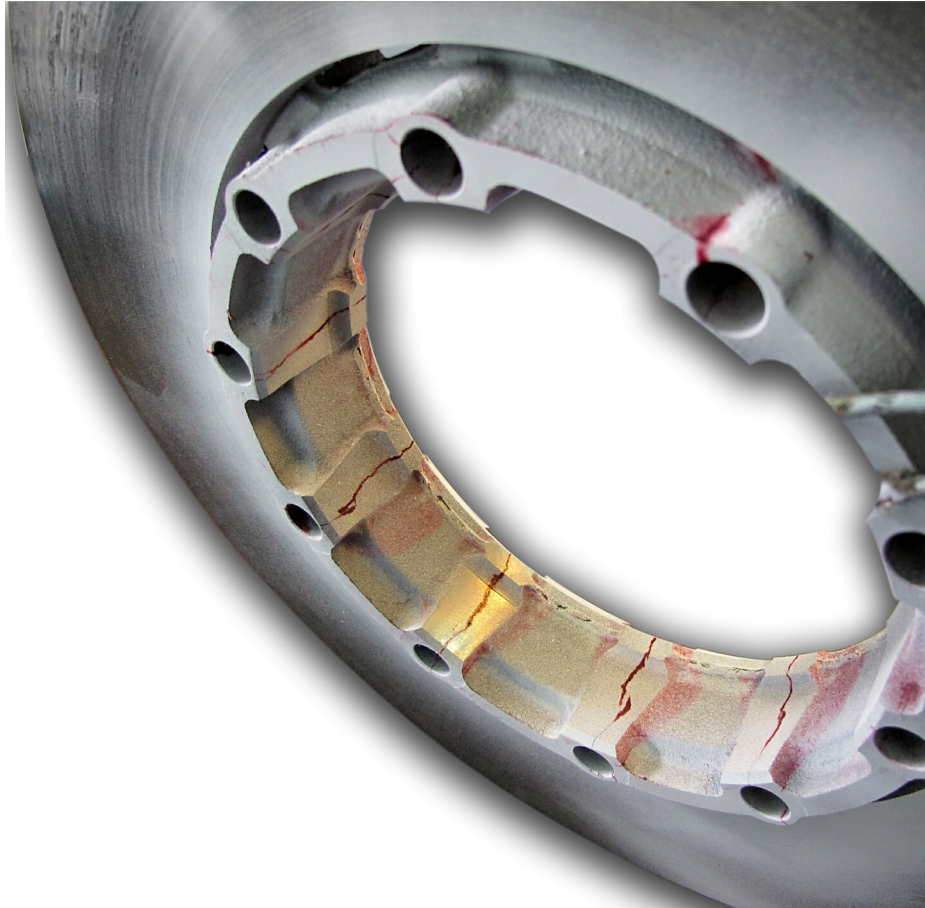
Figure 3: Continuous tension cracks in the area of the through-holes as the one-piece manufacture of the brake discs