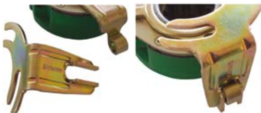
Fig. 3: SAF slack adjuster

It is different to the Haldex S-ABA in the design of its control arm: