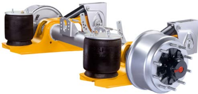
Fig. 1: SAF INTRADRUM

From February 2015, it will be fitted as standard on drum brake SNK 420x180.