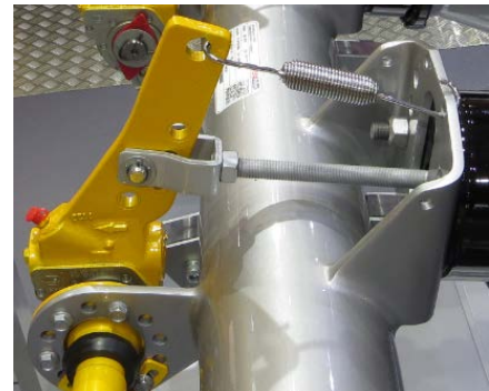
Fig. 2: SAF slack adjusters