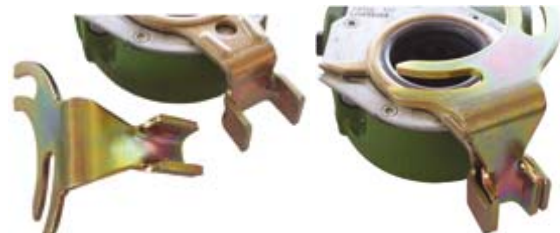
Fig. 4: Haldex slack adjuster