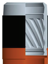
KNORR SN6: Open sealing