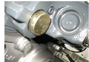
KNORR SN7: Complete covered DU guide pin

The corresponding spare part kits for the brakes above will be also modified with the new sealings.