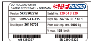
Fig. 2: From mid-2004