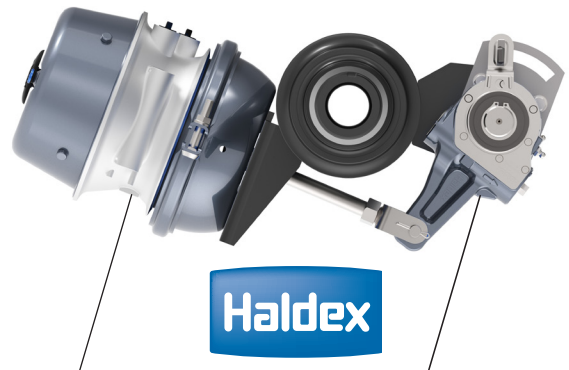
Haldex GoldSeal Spring Brake