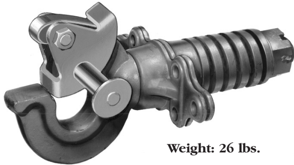
Weight: 26 lbs.